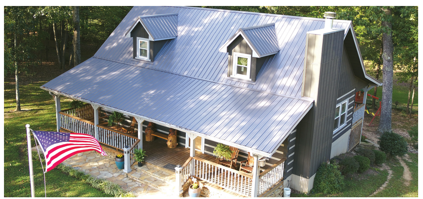
Panel-Loc Plus™, Charcoal