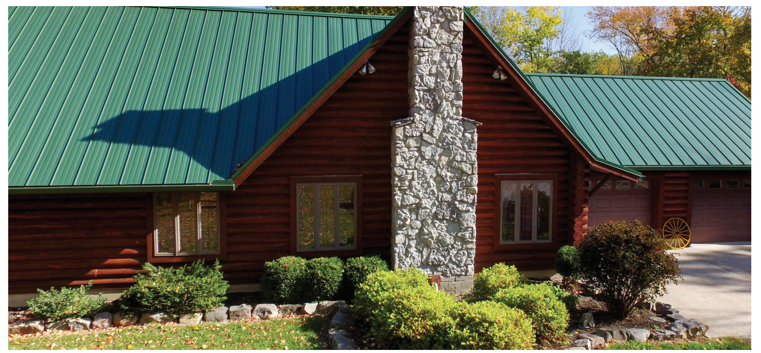
Horizon-Loc™, Basil texture