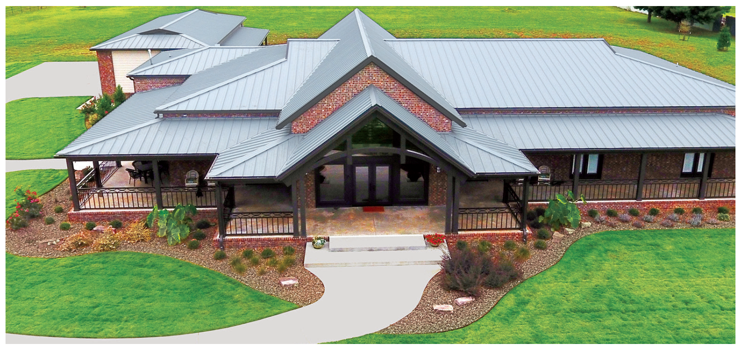
Central Snap®, Galvalume®