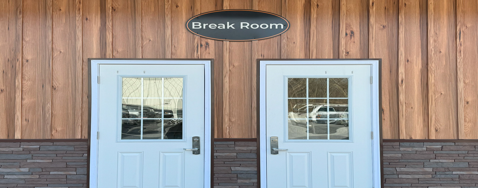
Hickory Board & Batten metal panels